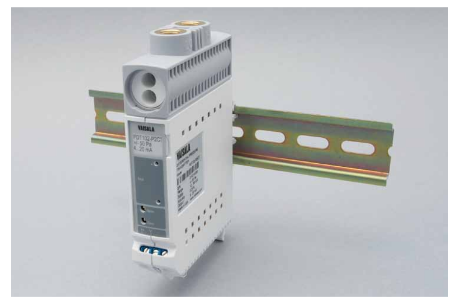
Vaisala Differential Pressure Transmitter PDT102 with process valve actuator and test jacks.