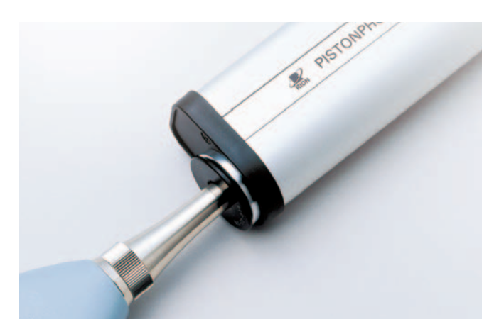
Usage example (NL series)

Carefully insert the microphone all the way into the coupler. Then simply turn the power on to apply a constant sound pressure level to the diaphragm of the microphone. The 1/2 and 1/4 inch microphones can be used after the supplied adaptor is installed in the coupler.