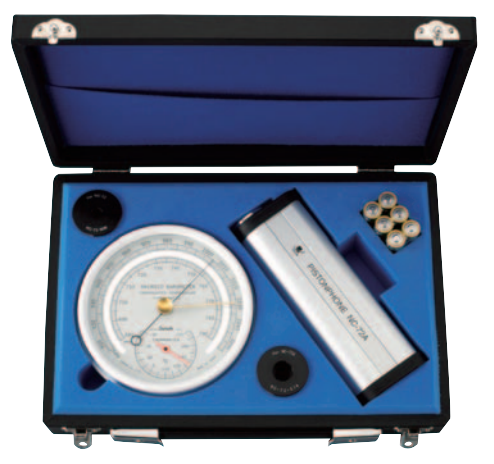
Carrying case (supplied)

NC-72A is designed to generate sound that has a sound pressure level of 114 dB(nominal) at 101.325 kPa of atmospheric pressure. Depending on the barometric pressure, the unit may need compensation. For this purpose, a barometer is supplied with the unit.