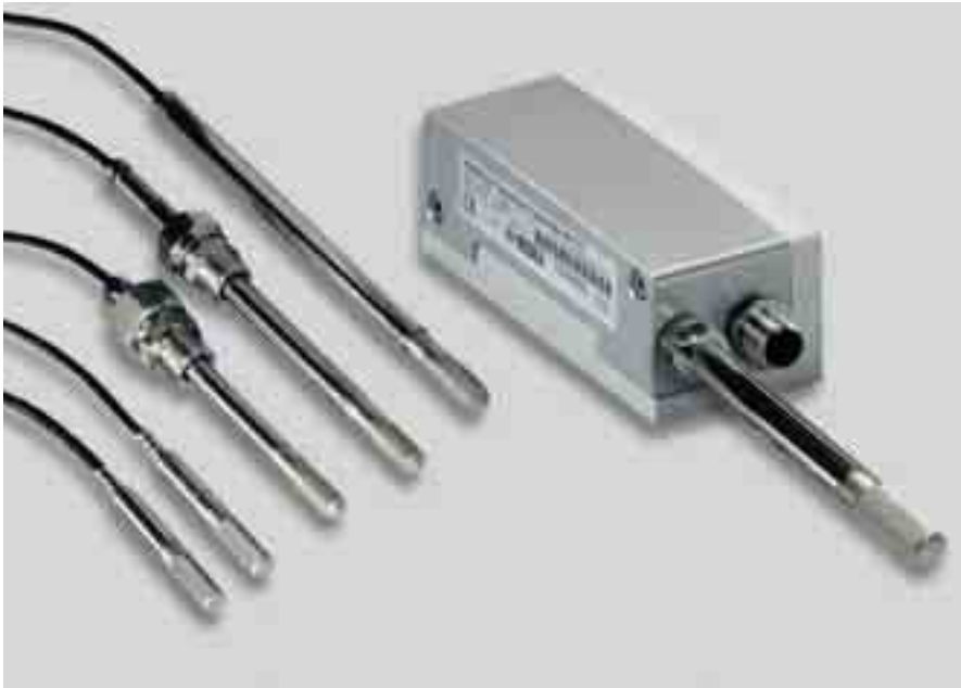
The Vaisala HUMICAP® Humidity and Temperature Transmitter HMT310 models (from left to right): HMT313, HMT317, HMT314, HMT318, HMT315 and HMT311.