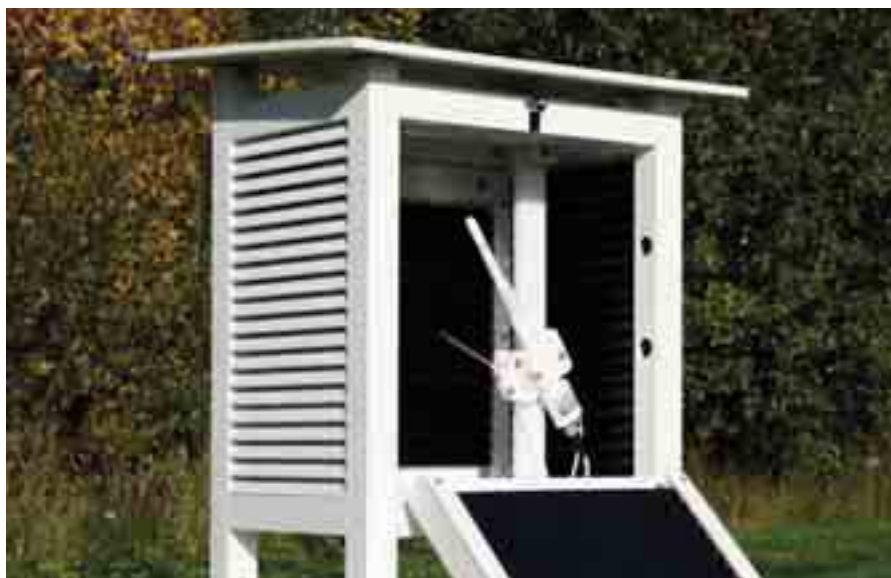
HMP155 with a new, stable HUMICAP®180R sensor and an additional temperature probe.