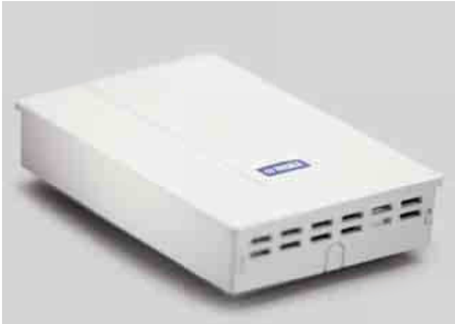
The Vaisala CARBOCAP® Carbon Dioxide Transmitter GMW115 is a wall-mounted CO 2 transmitter for demand-controlled ventilation.