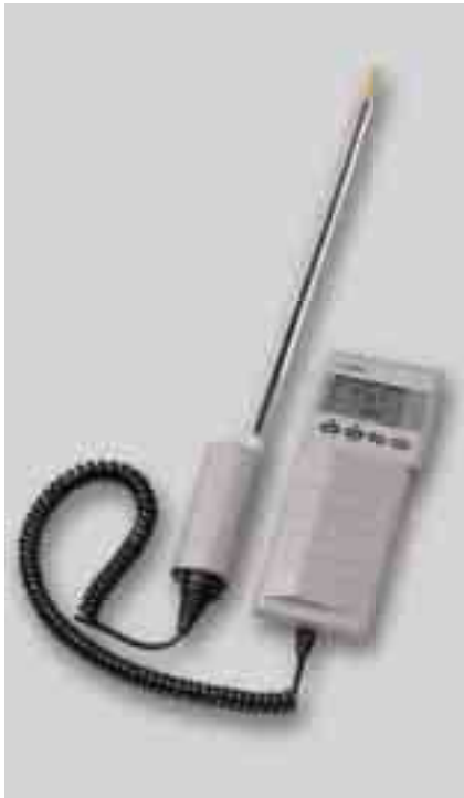
The Vaisala HUMICAP® Humidity Indicator HMI41 equipped with the Vaisala HUMICAP® Humidity and Temperature Probe HMP46 is an ideal combination for spot checking and field calibration.

The Vaisala HUMICAP® Humidity Indicator HMI41 fitted with the Vaisala HUMICAP® Humidity and Temperature Probe HMP46 can be used for spot checking humidity and temperature in ducts or chambers. Typical applications are plant maintenance, installation and inspection of air conditioning systems, production and storage areas and production processes. In addition, it is suitable for field checking Vaisala's humidity transmitters.