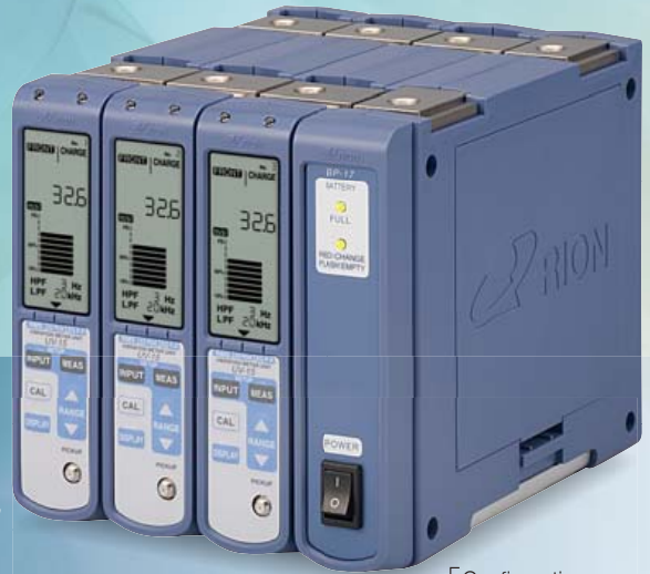
Configuration example showing three UV-15 units with BP-17

Provides connectivity for piezoelectric accelerometers, accelerometers with integrated preamplifier, and TEDS compliant accelerometers.