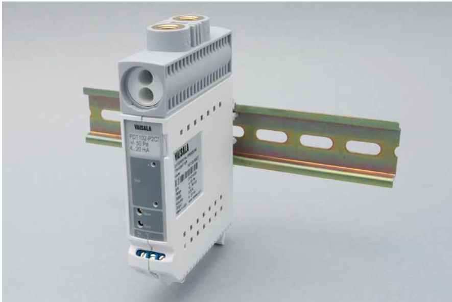
Vaisala Differential Pressure Transmitter PDT102 with process valve actuator and test jacks.