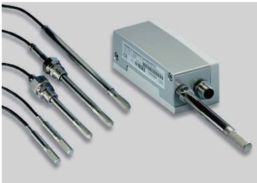
The Vaisala HUMICAP® Humidity and Temperature Transmitter HMT310 models (from left to right): HMT313, HMT317, HMT314, HMT318, HMT315 and HMT311.