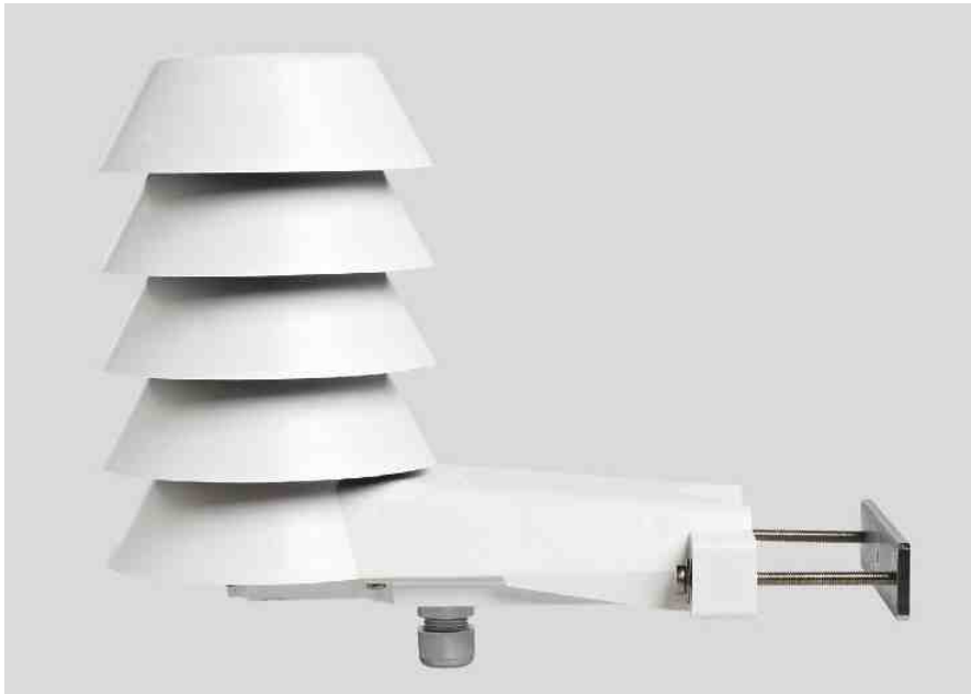
HMS110 Series Humidity and Temperature Transmitters with HUMICAP® sensor.

Vaisala HUMICAP® Humidity and Temperature Transmitter Series HMS110 are designed for demanding outdoor measurements in building automation applications. These \pm 2\% transmitters include an integrated radiation shield to reduce the influence of solar radiation on temperature and humidity measurements.