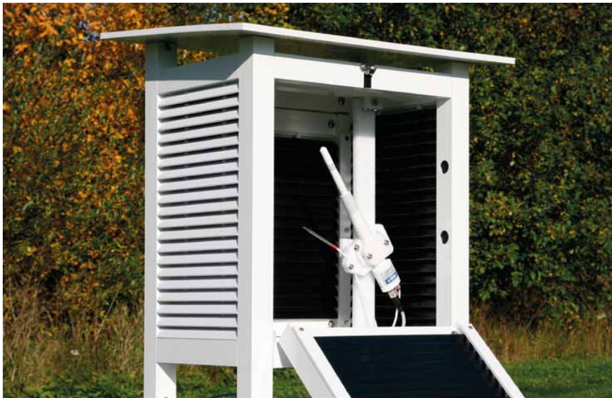
HMP155 with an additional temperature probe and optional Stevenson screen installation kit.

The Vaisala HUMICAP® Humidity and Temperature Probe HMP155 provides reliable humidity and temperature measurement. It is designed especially for demanding outdoor applications.